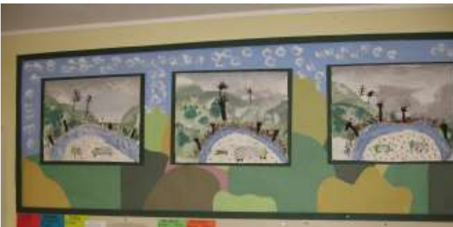
Landscapes by Key Stage 1

Art is taught as a subject in its own right as well as to support other curricular areas. The children develop skills and techniques using a variety of materials and tools. The work of famous artists is studied in both key stages and when possible the children experience the work of living artists through visits and workshops.