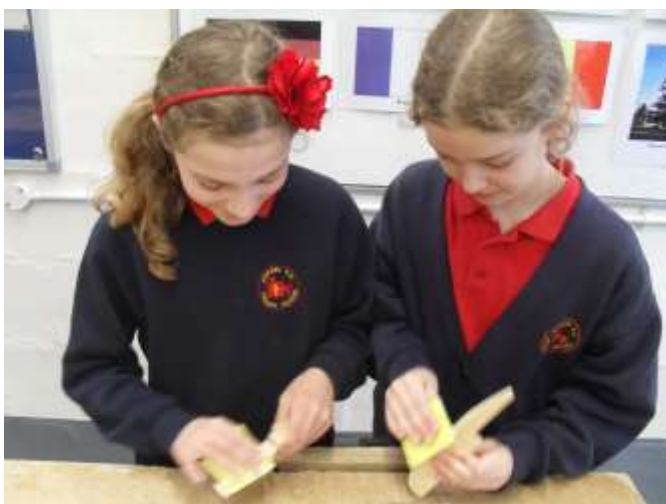
Working at a European day in Lancaster

All the children are encouraged to appreciate their natural environment and will look at ways to sustain and improve it.