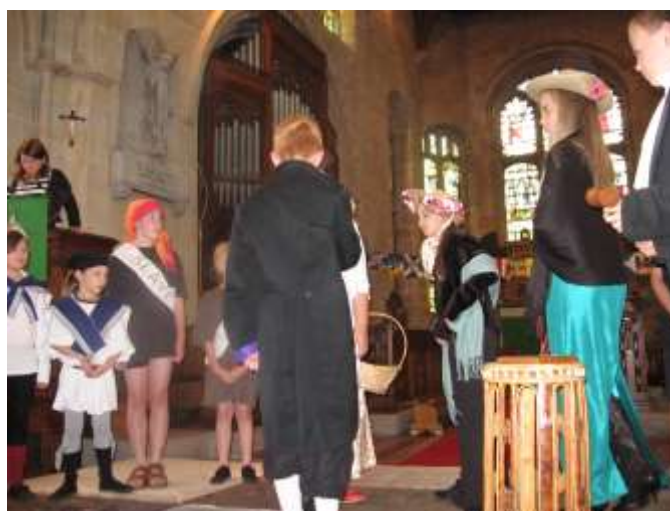
Performing a play about slavery.

Children are encouraged to write in many forms e.g. stories, poetry, plays, letters, newspaper articles, reports and explanations. Phonics, grammar, spelling and handwriting are taught directly and through the discussion and re-drafting of the child's work.