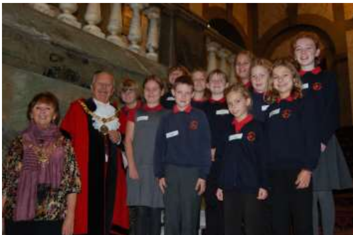
Meeting the mayor at Lancaster town hall

We aim to provide the pupils with an experience of history, which is both valid and stimulating. The infant children are taught about everyday life, leisure, work and culture of people in the past, and they are encouraged to compare it to their own experiences. The junior children are taught about important episodes and developments in Britain's history and in the history of other ancient civilisations.