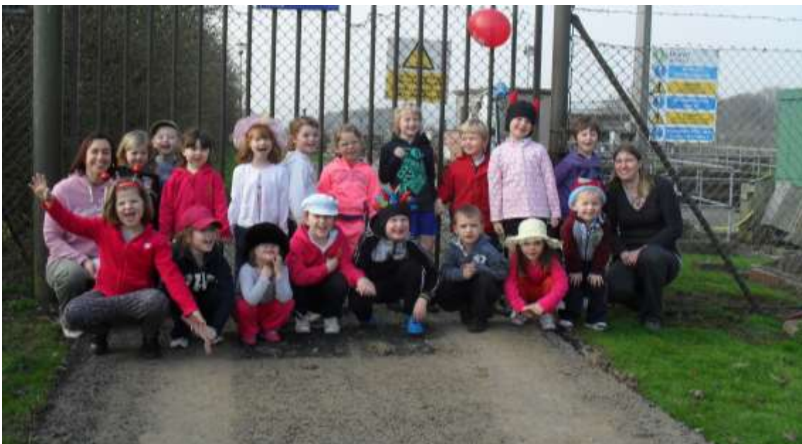
On our red nose day sponsored walk

A sports day is held in the summer term and junior-aged children compete in inter-school swimming galas, football and rounders matches. Children also participate in activities through our partnership with Wennington Hall High School and Lancaster Royal Grammar School.