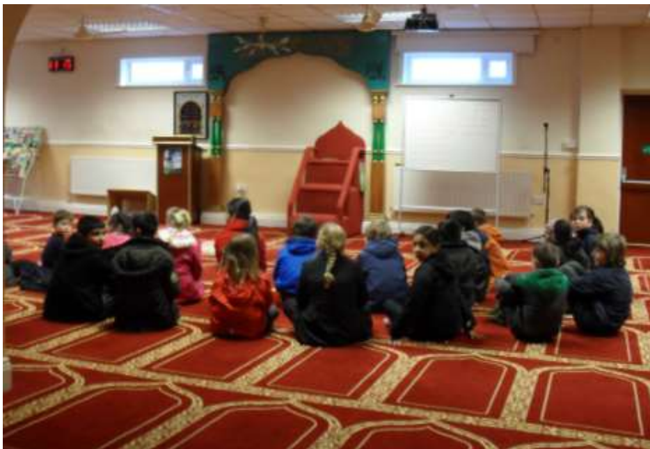
Visiting a Mosque with our link school in Nelson