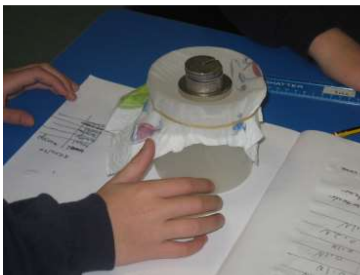
Testing the strength of a paper towel

To encourage enthusiasm and knowledge the children, whenever possible, investigate these topics practically. They learn how to relate findings, draw conclusions, understand and record how things are and predict the ways in which they might change.